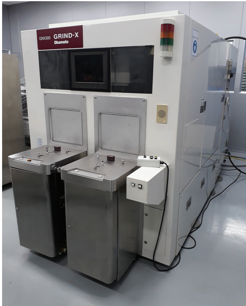
Okamoto GNX 300 Wafer Back Grinder #1